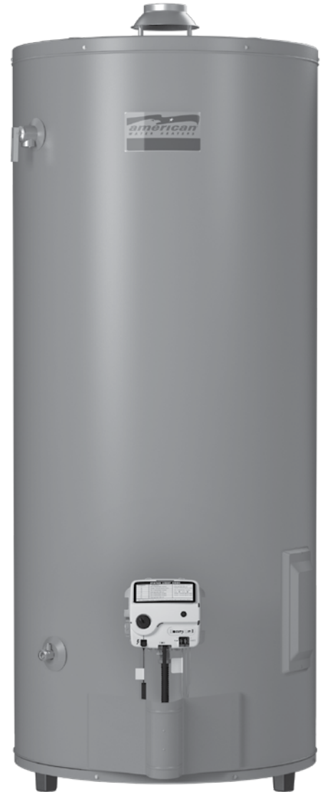
CG32-75 & CG32-100